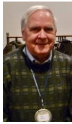
Circle of Service