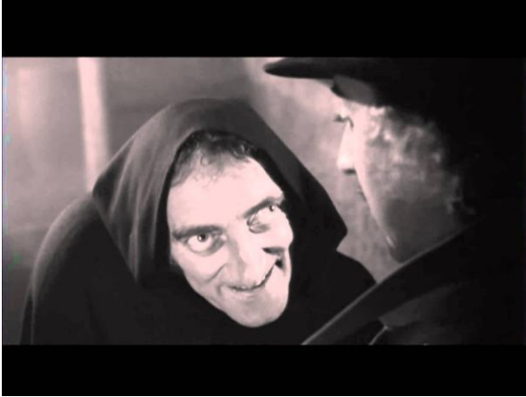
(Another Old One, but always worth a repeat...)

Honors: Bryn Mawr Book Award, Nomination for Outstanding Technical Leadership in the MN State Spotlight Theater Company, and varsity letter for Drama three years in a row.